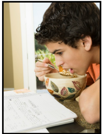
Test Tip #2 – Eat breakfast on each day of testing.